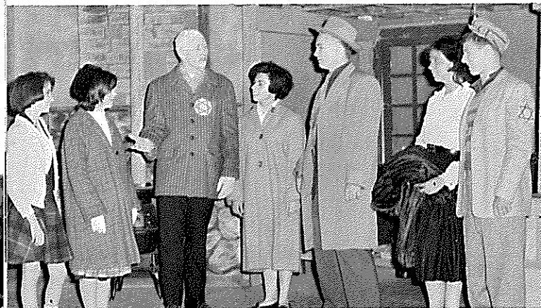
Anne Frank and Peter Van Daan discuss their lives while hiding out in the attic.

Mr. Frank explains to the others the rules and conditions by which they will have to abide if they are to survive.